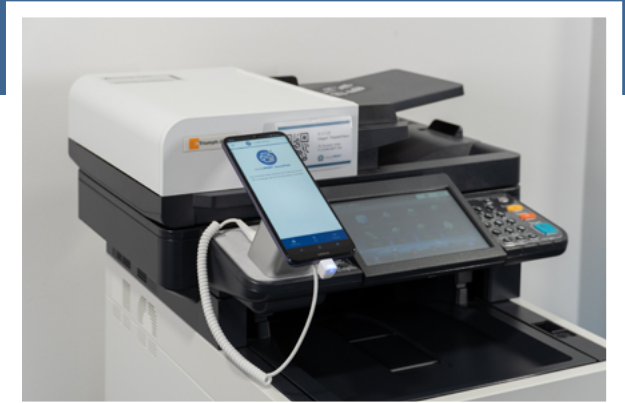
Theft-proof bracket available.