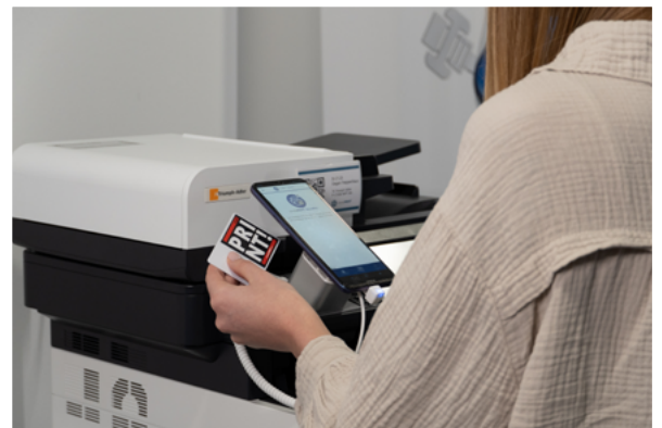
Authentication via card.....