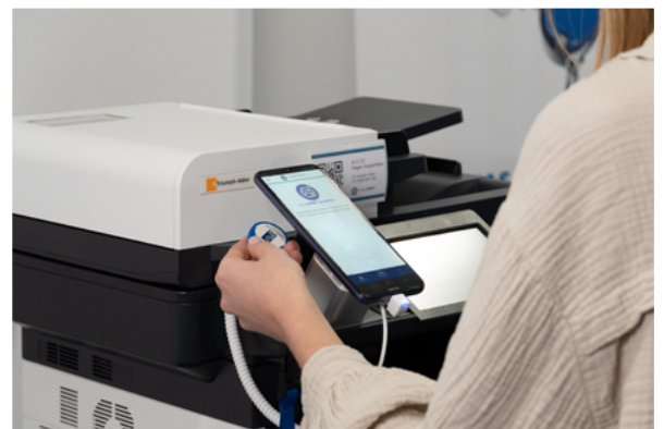
... or chip.