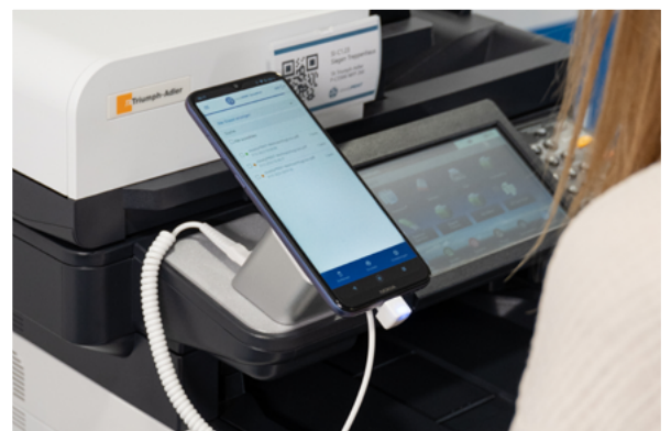
Release print jobs and start.